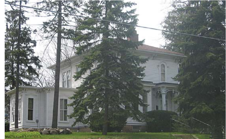
Orson Rogers House 309 West Grant Highway