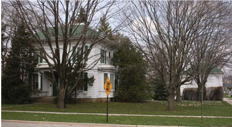
John Hutchinson House 206 West Washington Street