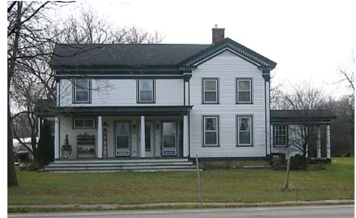
Loren Woodard House 927 East Grant Highway