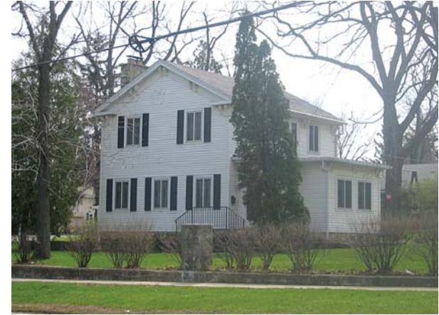
Thomas Hutchinson House 329 West Grant Highway

In 1994 this house became the city of Marengo's first bed and breakfast - called the Washington Street Inn.