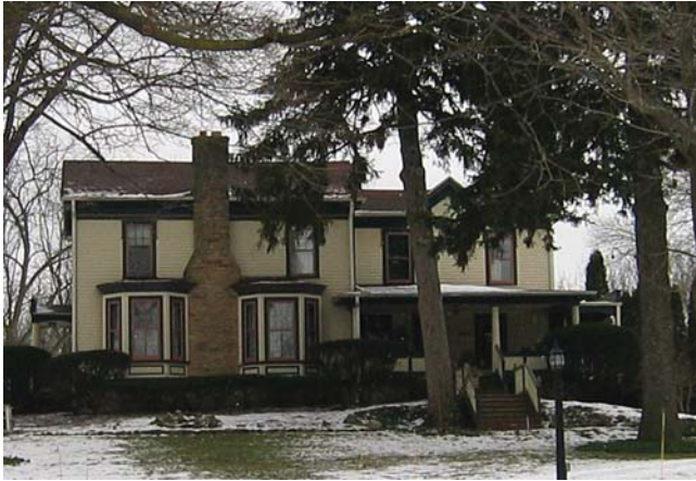
Ernest Robb House 209 East Forest Street