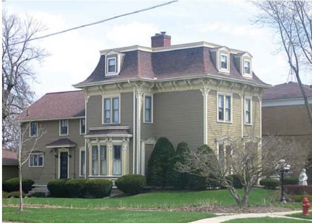
Henry Patrick House 304 East Washington Street