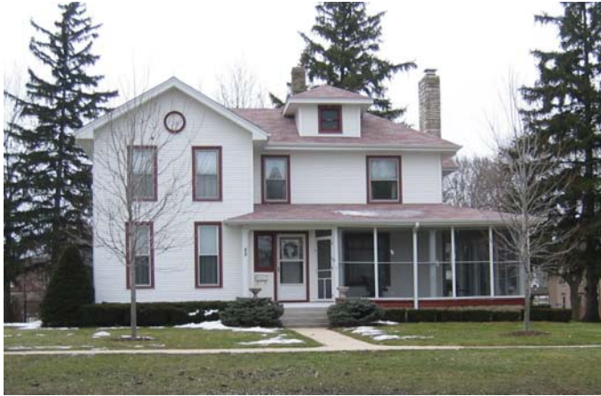
Pehr Lundgren House 614 West Grant Highway