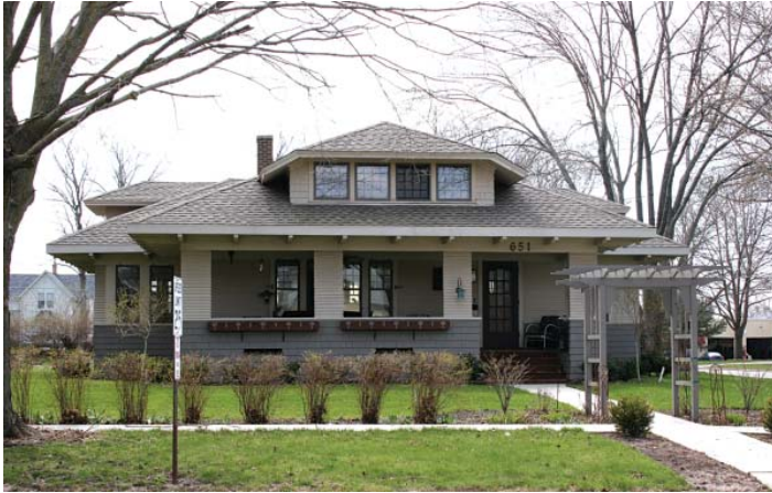
Dr. William Gooder House 651 W. Washington Street

Date Built: 1925 Builder: unknown Style: Craftsman