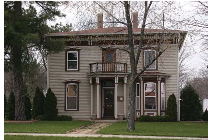
Amos Coon House 320 South State Street

Victorian Cottage - This style is a smaller version of the Queen Anne house which was typically two stories. The cottage form uses the asymmetrical forms and variety of building materials popular with the style but on a smaller, less elaborate scale.