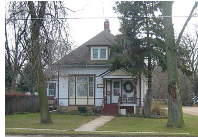
Charles Whittemore House 439 West Grant Highway