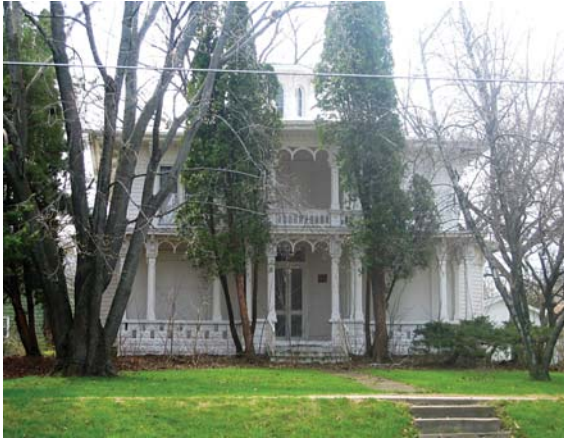
Charles Hibbard House 413 West Grant Highway

Date Built: 1846 Builder: Charles Hibbard Style: Italianate Marengo Landmark Listed: July 28, 2003