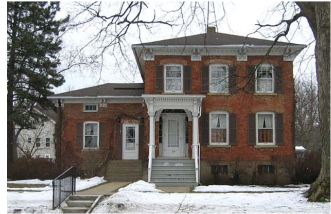
Prescott & Mary Read House 429 West Washington Street

This is a “mail-order catalog” home, shipped to Marengo by rail. The mail-order homes ordered from the catalog included plans, specifications and most materials down to the nails. They also provided cost estimates for such work items as labor and excavation so the customer would have an idea of the overall construction price. This is an excellent example of a Craftsman-style house.